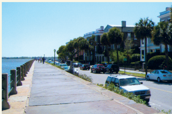
The Battery, Charleston

The Officers and the Board of Regents will meet this April for their midyear business meeting in Charleston, South Carolina. The gathering will commence with the Executive Committee meeting on the 29th of April, Section Committee meetings on the 30th, and the Board of Regents meeting on May 1. Unlike other years the