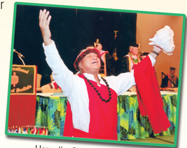
Hawaii Conch Blower